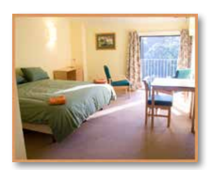
Room 1 (large bedroom)