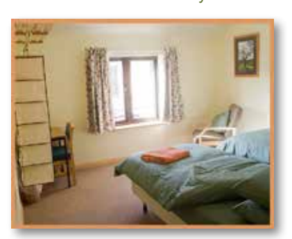
Room 4 (standard bedroom)